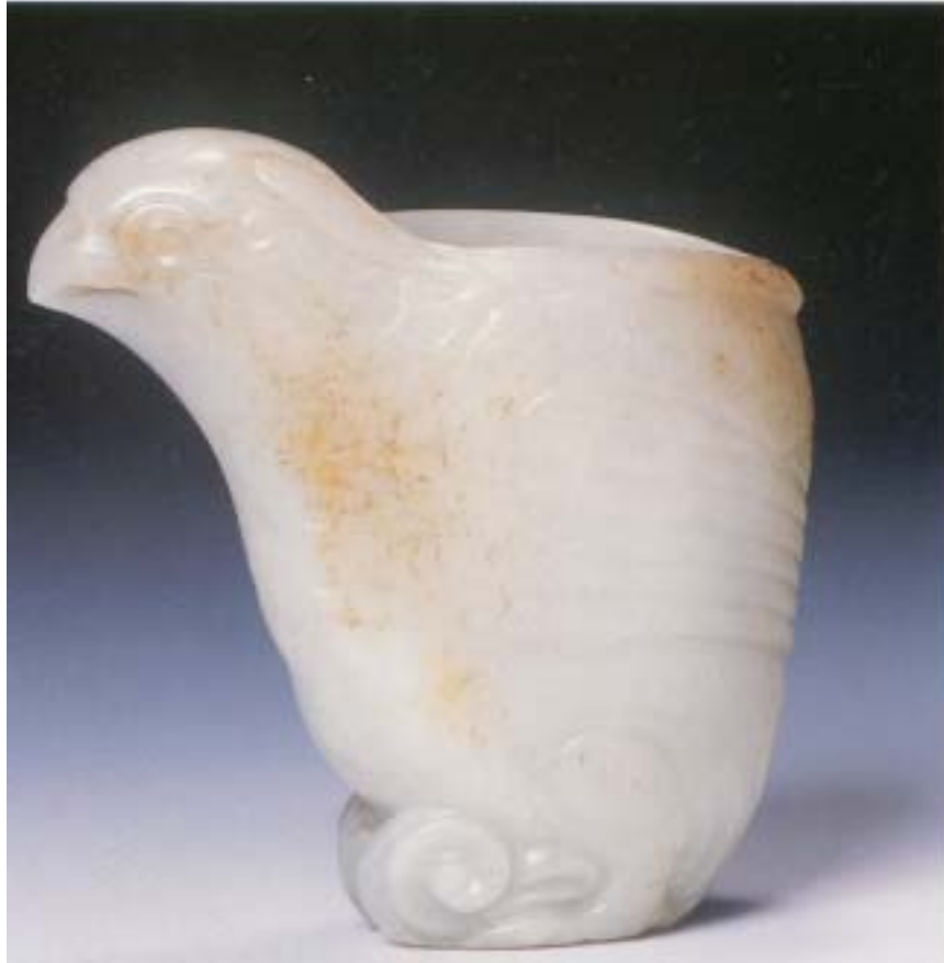
Bird-shaped vessel. Southern Song or Yuan dynasty (12th-14th century C.E.). Whitish nephrite with russet markings, H 7.6 cm, L 7.3 cm, W 3.5 cm. Museum of Far Eastern Art, Bath, England.