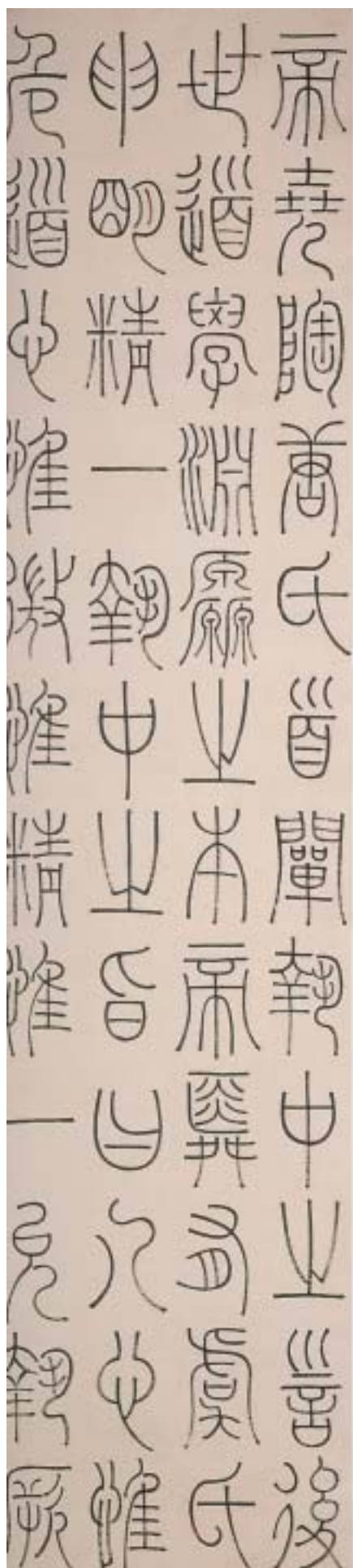
Deng Yan (Qing Dynasty) Scroll of seal script. L114.7 cm, W 33.4 cm. Collection of the Shanghai Museum.