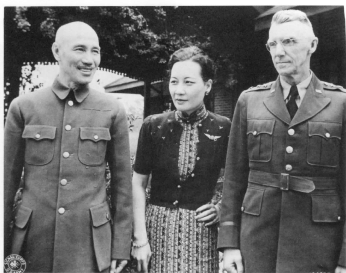
Allies at war: Chiang Kai-shek, Madame Chiang and US adviser Joseph 'Vinegar Joe' Stilwell.