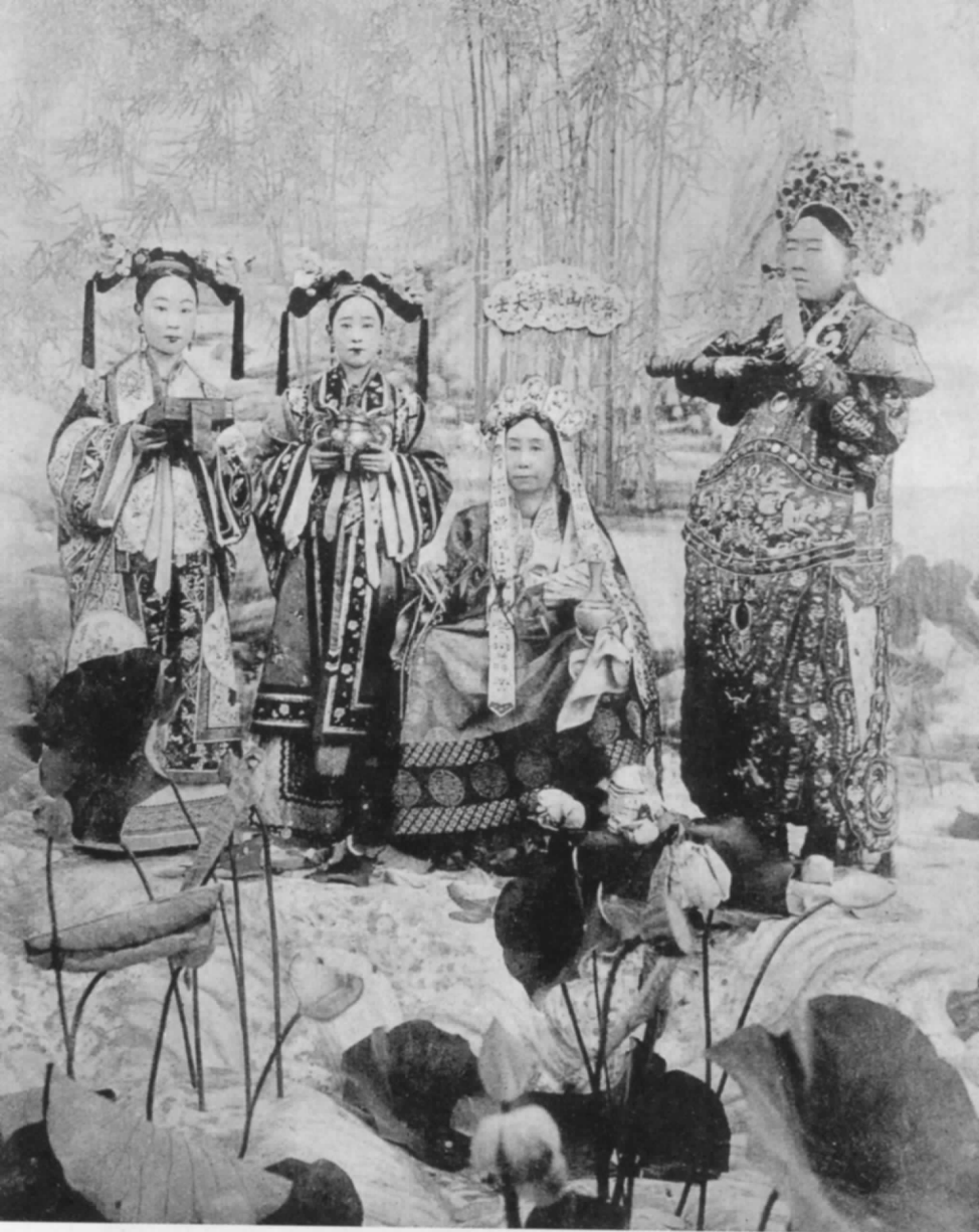
The power behind the throne: the Dowager Empress Cixi with her favourite eunuch and two attendants.