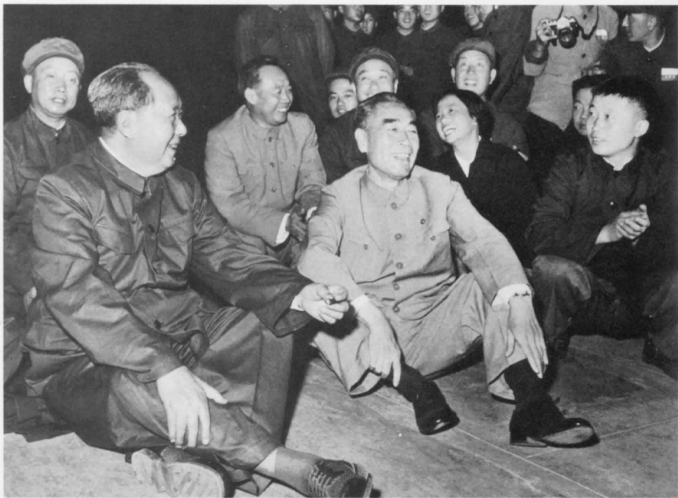
Above: Mao Zedong and Zhou Enlai watching the fireworks display in Peking on the eve of National Day, 1966.