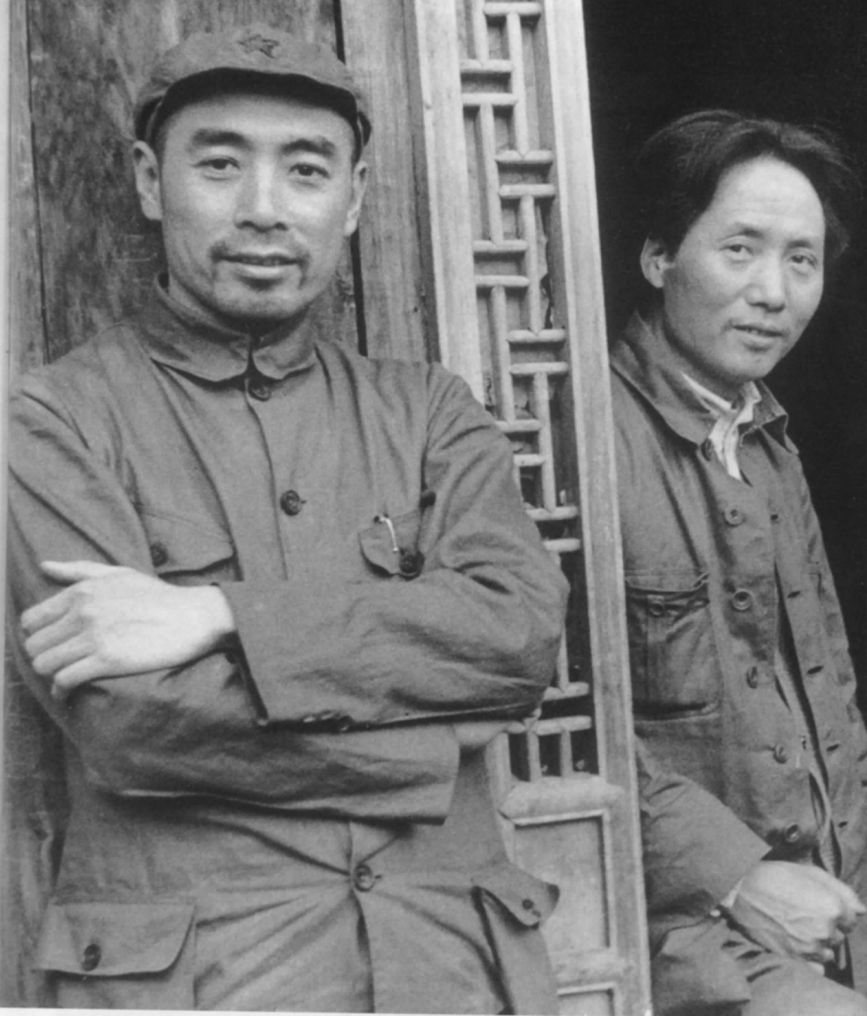
The leader and the lieutenant: Mao Zedong ( right ) and Zhou Enlai ( left ) in the Yanan base in Shanxi province in 1937 after the Long March.